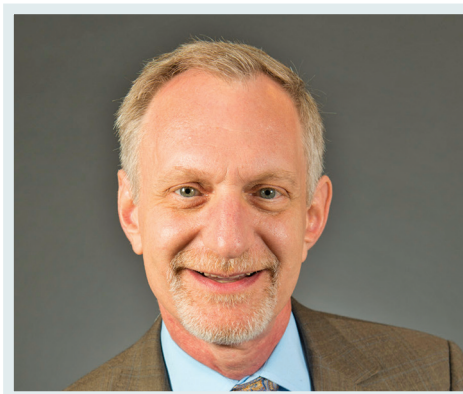
Robert J. Waldinger, MD

Both psychotherapy and meditation are ways of studying the mind. Zen helps us see the difference between the stories our minds create about the world and what the world is really like. The analogy often used is the difference between reading a menu and tasting the food. Our descriptions of the world — for example, a description of the taste of chocolate — cannot begin to do justice to experiencing the real thing.